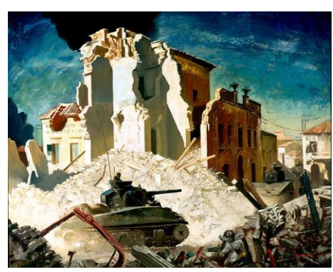
Canadian Armour Passing Through Ortona, by Dr. Charles Comfort . Canadian War Museum