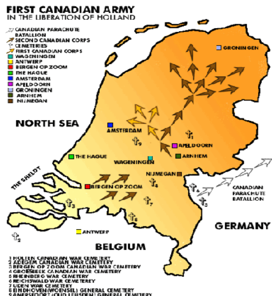
Liberation of Holland